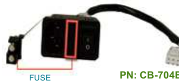
PN: CB-704EC-RS 20 cm AC input cable with fuse