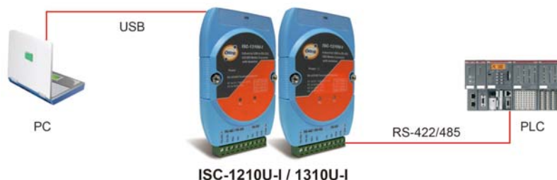
Connections of Media Converter

The ISC-1210U-I / ISC-1310U-I convert is an intelligent, stackable expansion module that connects to a PC USB port or USB Hub via the Universal Serial Bus(USB) port, providing one High-Speed RS-232/RS-422 or RS-485 serial port(jumperless). The ISC-1210U-I / ISC-1310U-I features easy connectivity for traditional serial devices. The RS-232 standard supports full-duplex communication and handshaking signals (such as RTS, CTS) and The RS-485 control is completely transparent to the user and software written for half-duplex COM works without any modification. The ISC-1210U-I / ISC-1310U-I's Opto-isolators provide 3000 VDC of isolation to protect the host computer from ground loops and destructive voltage spikes on the RS-232/RS-422 and RS-485 data lines. ISC-1210U-I / ISC-1310U-I also offer internal surge-protection on their data lines. Internal high-speed transient suppressors on each data line protect the modules from dangerous voltages levels or spikes. The ISC-1210U-I / ISC-1310U-I module derives the power from USB port and doesn't need any aid of external power adapter.