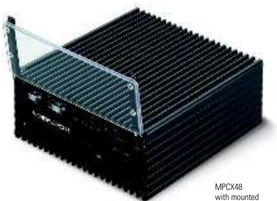
MPCX48 with mounted option 814325, front cover and DVD/CD