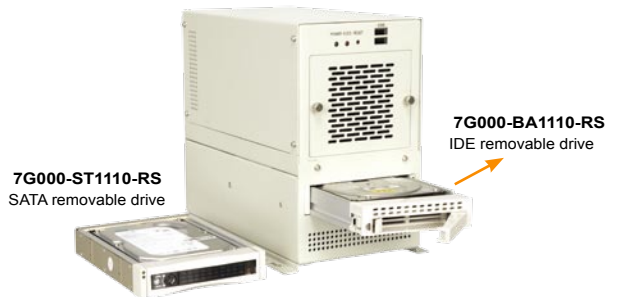
3.5" SATA/IDE removable drive bay compatible

HDD and removable drive bay are not included in package.